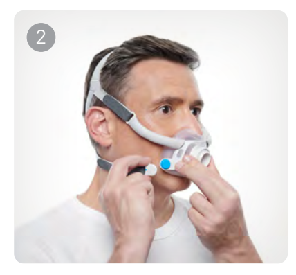
Bring the lower straps behind the ears and reattach to the frame with the magnetic clips*. Feed longer hair through the back of the frame, if needed.