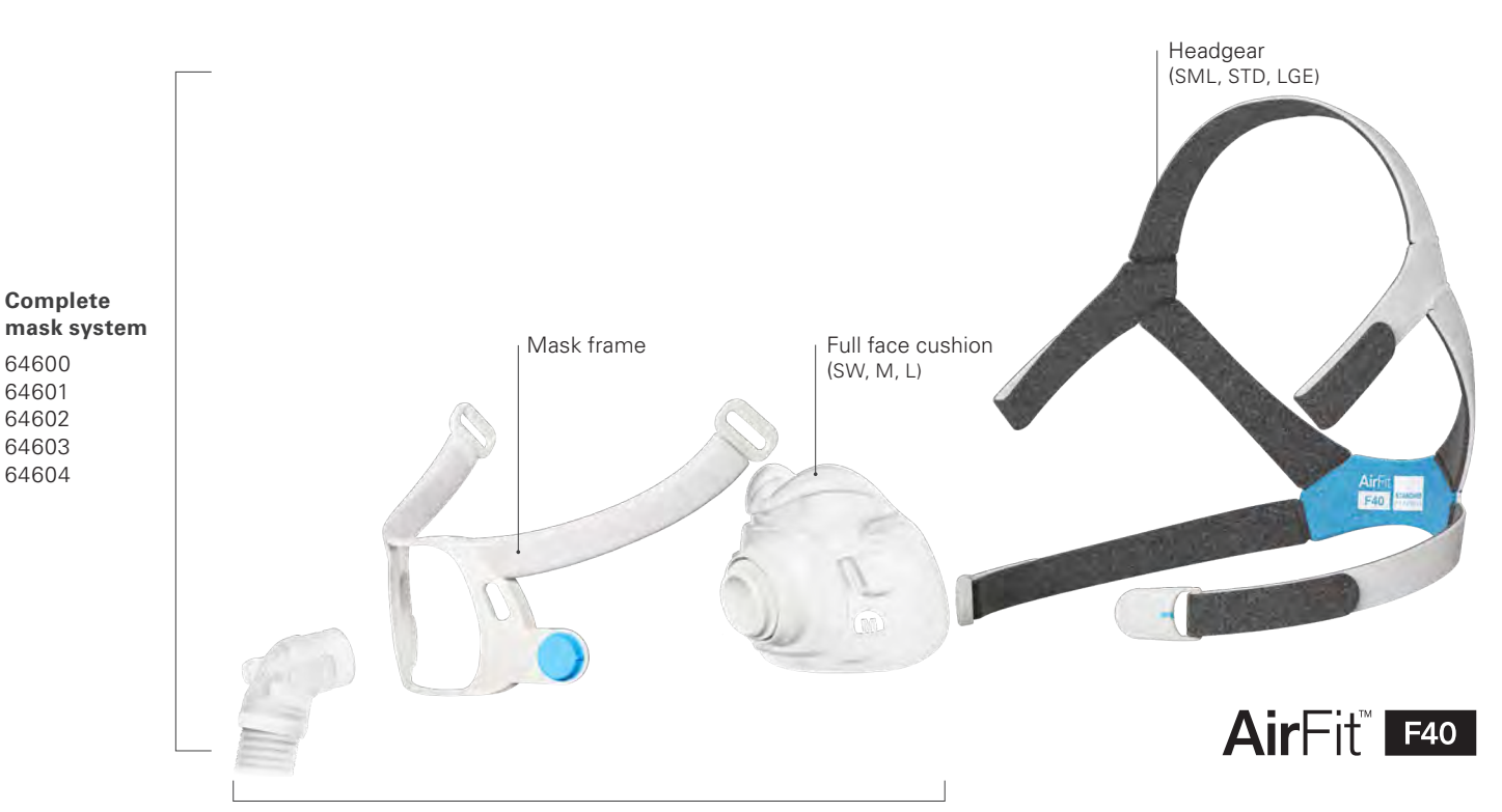
Frame system 64607, 64608, 64609