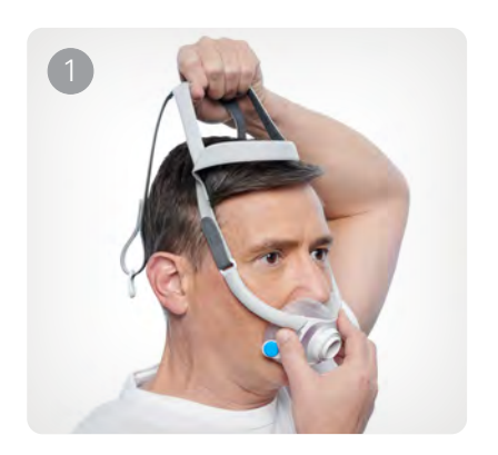
Unclip the lower straps away from the frame and place cushion under the nose to fit against the face. With the ResMed logo facing up, pull headgear over head.